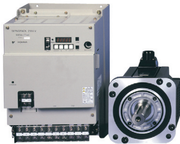
MOTION CONTROL SERVO MOTORS & AMPLIFIERS