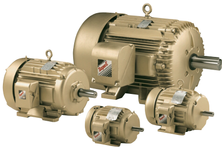
AC/DC MOTORS GEAR REDUCERS