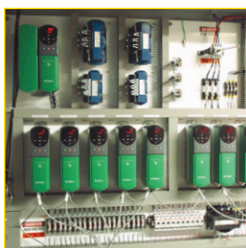
CUSTOM PANELS & ELECTRONIC REPAIRS