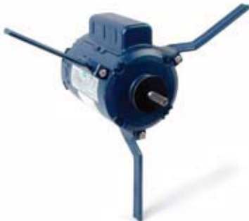
PERFORMA+ Fan Motor Performance @ 0.05 Inches S.P.

These Performa+ motors are designed for easy and economical replacement of other popular three-arm fan motors. The motors feature adjustable brackets. ARM12FPKIT has three arms and mounting hardware. By simply cutting the arms to length you can cover many different fan and housing sizes.